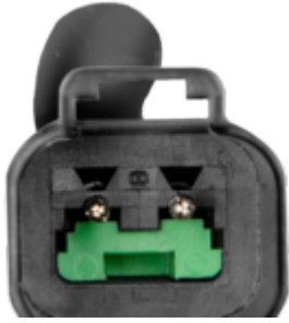
Pigtail Deutsch 2-pin